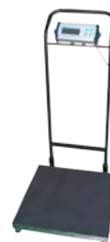
CPWplus - M